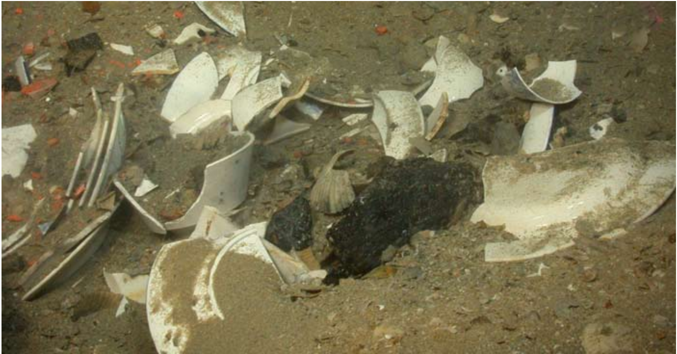
Fig. 4. A mid to late 19th-century shipwreck in the English Channel (Site 2T11w24b-1) at a depth of 124m, where a cargo of probable white ironstone bowls and plates has been partly smashed and dragged out of context by beam trawlers or dredges.

Destructive cultural impacts on shallow water wrecks are, of course, reasonably well known. In addition to large-scale looting, these sites can be impacted by piers and jetty construction, for instance, as well as harborworks, pipelines and dredging (Stewart, 1999: 576-77). More recently, Quinn (2006: 1420) has rejected the widespread theory that considers wrecks to exist in a state of equilibrium with the surrounding environment and acknowledges that “wreck sites act as open systems, with the exchange of material (sediment, water, organics and inorganics) and energy (wave, tidal, storm) across system boundaries. Wrecks are therefore generally in a state of dynamic (not steady-state) equilibrium with respect to the natural environment, characterized by negative disequilibrium, ultimately leading to wreck disintegration.”