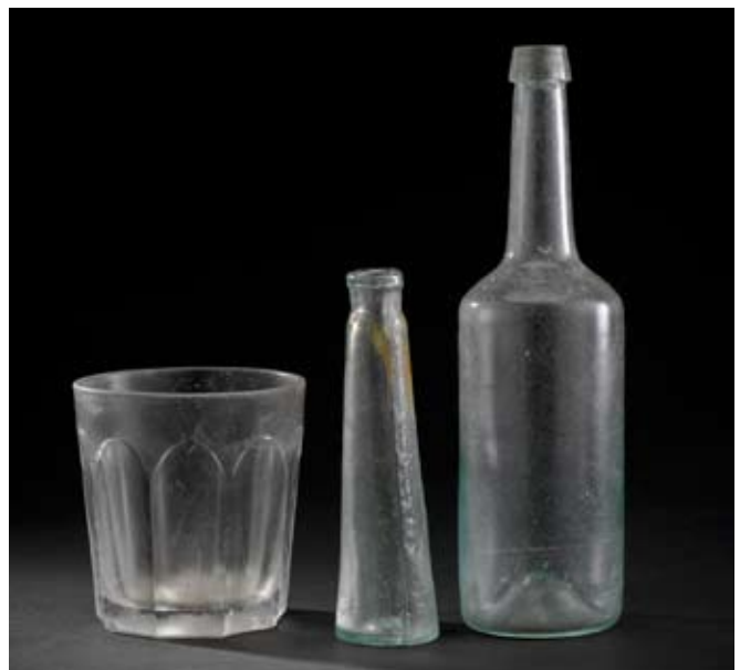
Fig. 14. Glass tumbler and bottles. Mold-made American paneled tumbler, 1845-75. Patent medicine bottle, tapered, narrow neck, designed for limited evaporation around the cork. Turn-mold, utilitarian bottle with indented base. Jacksonville 'Blue China' wreck.