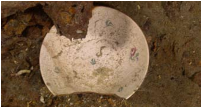
Fig. 10. An intact English tea saucer with a floral pattern. England, c. 1845-55, H. 14.6cm. Jacksonville 'Blue China' wreck, 2005.

Using a delicate 'hover and recover' strategy, rather than sitting directly on and disturbing the seabed, Odyssey's 8-ton ROV was flown above the wreck, while its manipulator arms recovered a cross-section of artifacts. Limited trial-trench excavation confirmed the near-total absence of stratigraphy at the site, which had been flattened into a single layer of artifacts overlying the hull remains. Analysis of the recovered artifacts has confidently revealed a date of 1840-60 for the wreck, but so far has not produced a candidate for the identity of this lost ship. This collection of artifacts has been conserved, document-