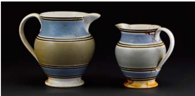
Fig. 11. English slipware jugs, tan and blue-grey bands flanked by two brighter blue bands. Larger jug H. 19.6cm. Eight jugs were recovered in four different sizes. Glass tumblers had been packed inside them to maximize storage space. Jacksonville 'Blue China' wreck.