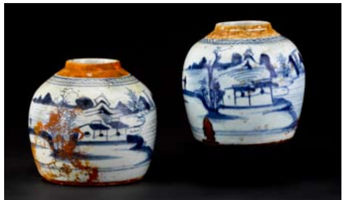
Fig. 13. Ginger jars, Canton, China, c. 1840-60. Porcelain, H. 15.3cm. Two of four examples found on the Jacksonville 'Blue China' wreck.