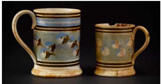
Fig. 12. English mugs, cat's-eye slip decoration framed by double narrow brown bands. H. of larger jug 11.4cm. Jacksonville 'Blue China' wreck.