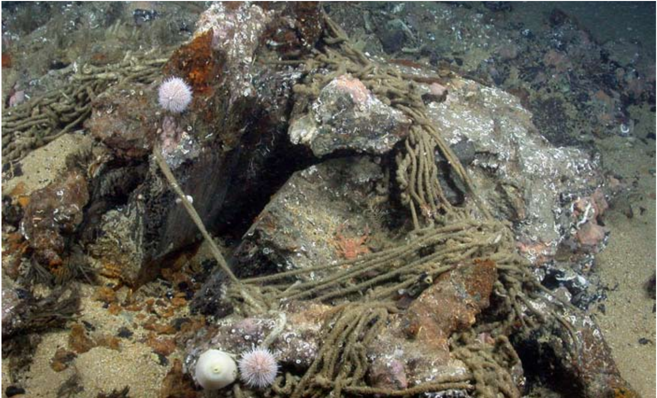
Fig. 3. A mid to late 19th-century shipwreck in around 100m in the English Channel (Site 2T3a6a-2) with fishing net rope caught on its structure. Snagging by trawler nets, scallop dredge heads, foot rope and steel cable is prevalent in the Channel and breaks off and displaces any ship's structure or cargo in its way.

This process often involves sandbagging or covering a wreck with a synthetic mesh designed to trap and hold sediment and foster the re-growth of natural flora and fauna, which theoretically helps seal and protect archaeological remains, as initiated in about 13m during stabilization trials on HMS Colossus , lost off the Scilly Isles in 1798 (Camidge, 2003: 12). A similar strategy of in situ preservation through reburial was adopted for the Avondster , a 4m-deep Dutch East Indiaman wrecked in 1659 on the shores of Galle Harbour, southern Sri Lanka (Manders, 2006), to deter looters and stop biological and chemical deterioration. Part of the site was covered with polypropylene nets in the hope of promoting the deposition and retention of the sediment cover, thus facilitating a return to the anaerobic environment that originally preserved the archaeological remains. Strips of artificial sea grass matting placed around the William Salthouse , a wooden sailing vessel lost in 1841 in 13m of water off Port Phillip Heads in Victoria, Australia, eliminated scour and increased the deposition of sediment across the site (Staniforth, 2006: 54). PVC ports are sometimes installed in such reconstructed seabeds to measure chemical activity and deterioration.