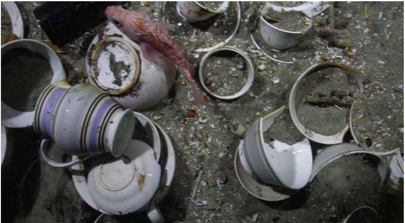
Fig. 9. Broken pottery vessels on the Jacksonville 'Blue China' wreck, 2005.

During this survey, formerly unrecorded material was identified: small kegs of what appeared to be white lead, whose staves and hoops had completely deteriorated; yellow slip-decorated earthenware chamber pots and undecorated whiteware consisting of plates, bowls, chamber pots, wash basins and salve jars; hand-painted ceramic teaware, including tea bowls, saucers, cream jugs and sugar bowls decorated with floral and berry motifs; two individual printed plates, one bearing a Blue Willow pattern, the other a brown Asiatic Pheasants pattern; two different types of clay smoking pipes; transparent green, aqua and clear