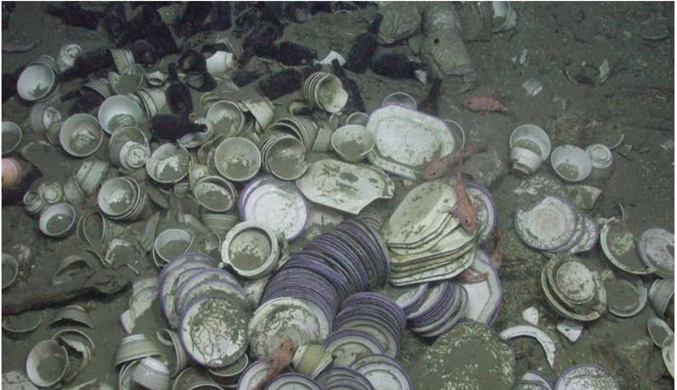
Fig. 7. The cargo of English blue shell-edged ceramic plates, bowls and serving platters at the southern end (bow) of the Jacksonville 'Blue China' wreck site, with a consignment of glass bottles in the background.