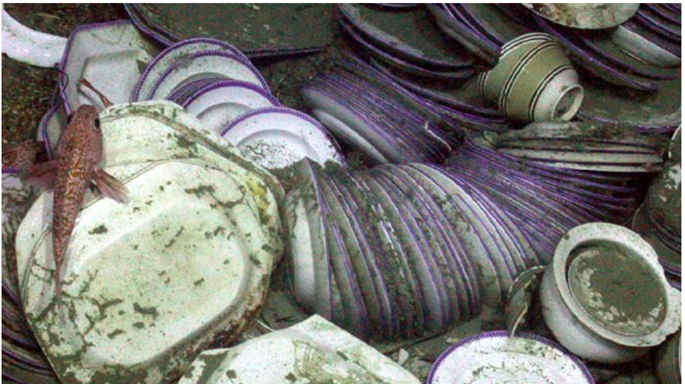
Fig. 8. Detail of English blue shell-edged ceramic plates, serving platters and slipware bowls from the Jacksonville 'Blue China' wreck.