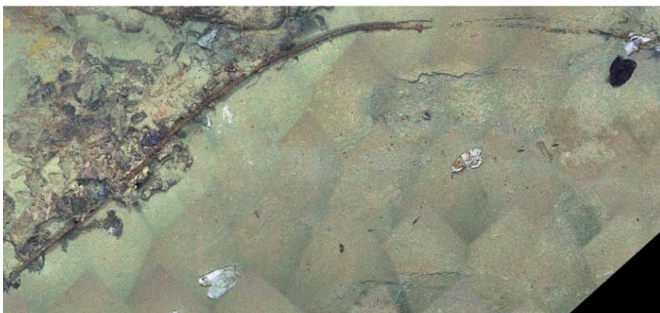
Fig. 2. Trawler fishing cable snagged on iron cannon on Site E-82 in the Straits of Gibraltar.