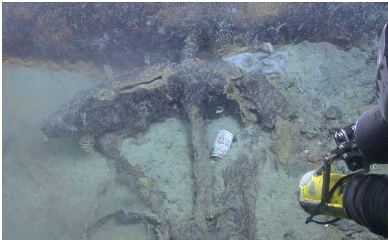
Fig. 1. A beer can and plastic bag next to a heavily concreted iron anchor at 821m depth on Site E-82 in the Straits of Gibraltar.