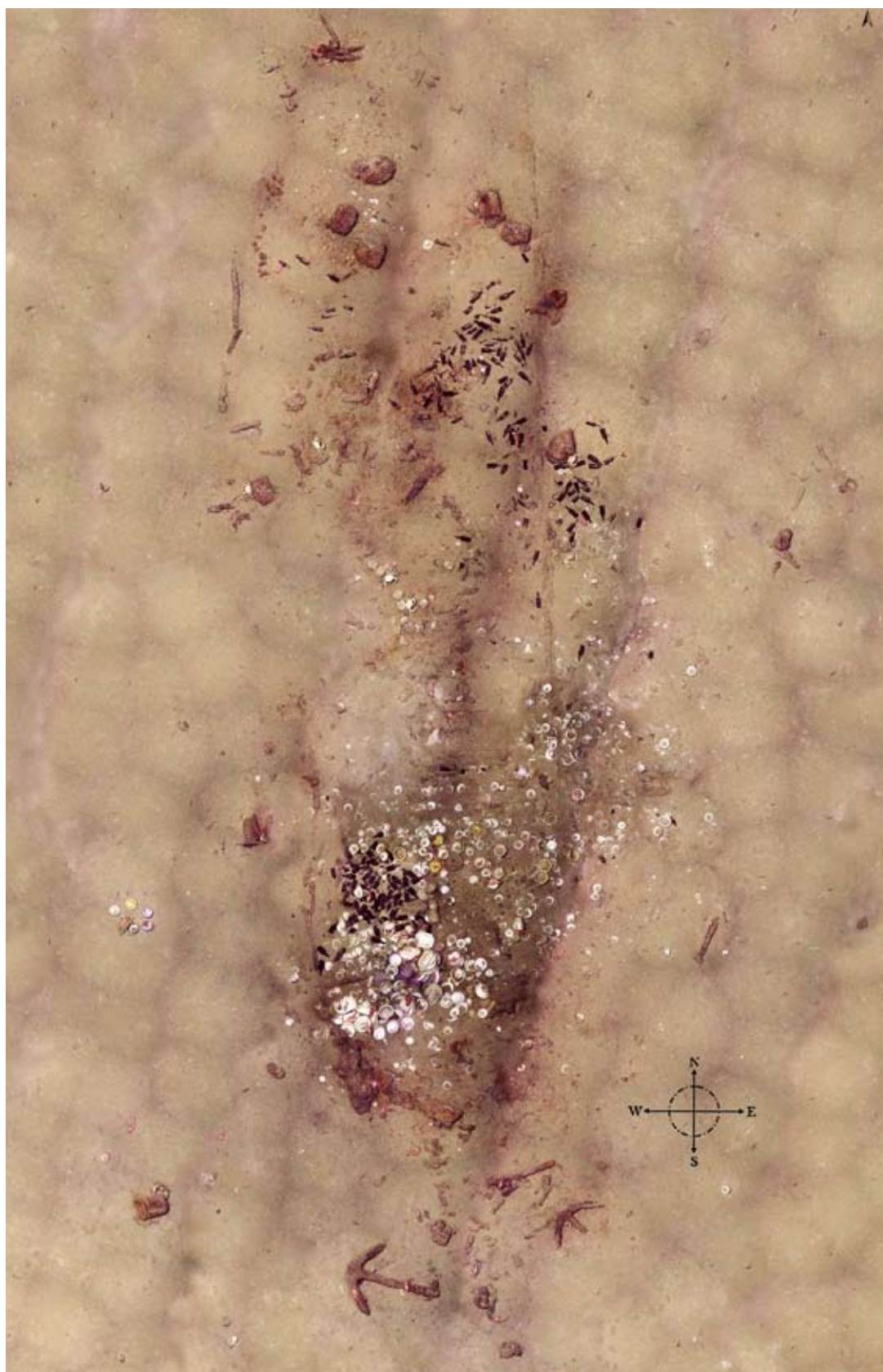
Fig. 6. Photomosaic of the 370m-deep Jacksonville 'Blue China' wreck (Site BA02), 2005.